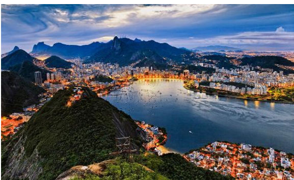
Tijuca National Park

Hotel breakfast followed by train up Corcovado ( hunchback in Portuguese), a famous mountain with a granite peak, located in Tijuca National Park . Riding through the forest in this swiss built train is already a wonderful experience and you will be rewarded with beautiful views of the lagoon. Trains leave every 20 mins and the ride takes about 20 mins, see views of Cristo Redentor . Upon reaching the top you will be greeted by a spectacular 360 degree city view, soak up the scenery and feel dwarfed by