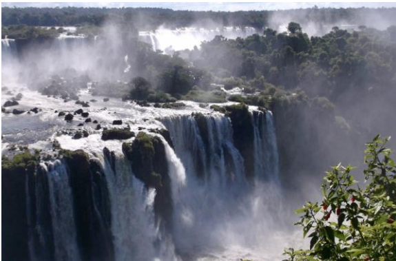
The Brazilian Falls

Enjoy breakfast in the comfort of your hotel, check-out, airport transfer, depart Rio de Janeiro around 0935hrs arrive Argentina 1145hrs (approx. flying time 02hrs 10mins) meet and greet upon arrival, transfer to visit Brazilian side of the Falls.