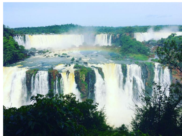
The Brazilian Falls

The tour starts at the visitors' center, designed to access the park. In order to be able to start the circuits along the catwalk floors, visitors take one of the modern panoramic view busses to move safely within the park. The length of the catwalk floors is 1,200 meters from where you can get a breathtaking view of the 275 waterfalls. The four main rapids on the Brazilian side are: Floriano, Deodoro, Benjamín Constant and Salto Unión. At the end of the path everyone will get on a panoramic elevator that will take them to the bus units.