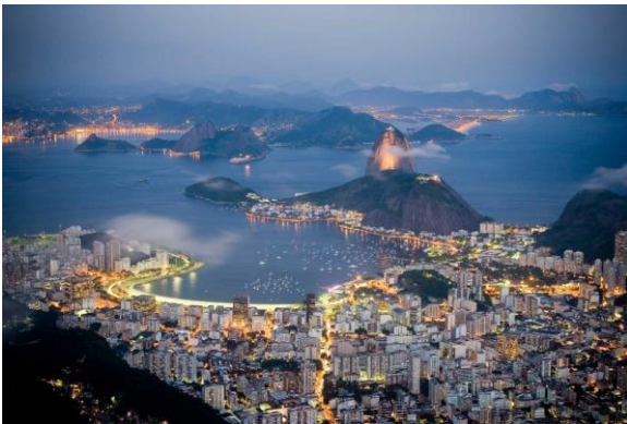
Rio de Janeiro

Check-in on Wednesday evening 14 th of February, depart Hong Kong 15 FEB 0035hrs, arrive Dubai 0420hrs (approx. flying time 07hrs 45 mins), connecting flight depart Dubai 0710hrs arrive Rio de Janeiro 1530hrs (approx. flying time 14hrs 20 mins). You will be assisted at Rio Airport and escorted to your modern, well-equipped coach for your hotel transfer. Check-in and relax.